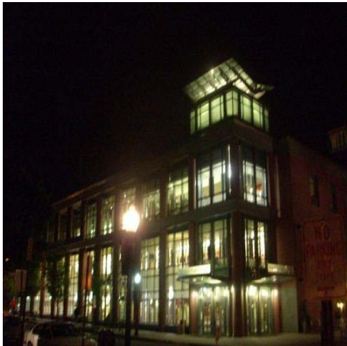
Princeton Public Library (Princeton) #4 of 38 things to do in Princeton "What don't they do for you" 04/22/2015 "wonderful library" 04/21/2015