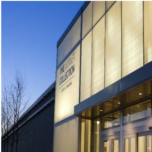
The Outlet Collection - Jersey Gardens (Elizabeth) #1 of 10 things to do in Elizabeth "Jersey Gardens Mall Complex, Elizabeth NJ" 04/21/2015 "well worth the trip" 04/21/2015 Welcome to The Mills at Jersey Gardens, New Jersey's largest outlet and value retail center with... more