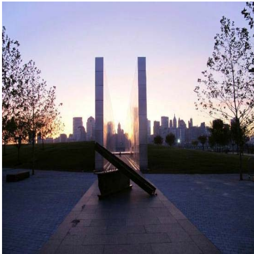
Empty Sky - 9/11 Memorial (Jersey City) #1 of 42 things to do in Jersey City "Very Somber but fitting Memorial" 04/20/2015 "Stumbled on this very nice memorial" 04/19/2015