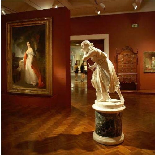
Princeton University Art Museum (Princeton) #2 of 38 things to do in Princeton "Hidden Gem" 04/18/2015 "If you love art, you visit." 04/10/2015 The Princeton University Art Museum is one of the nation's finest art museums, housing collections... more