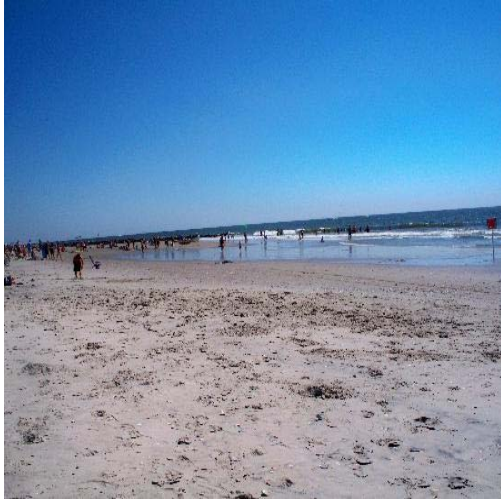
Ocean City Beach (Ocean City) #2 of 29 things to do in Ocean City "Crowded but very nice" 03/03/2015 "Perfect weather and "crowd" in mid-September" 02/23/2015