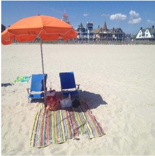
Cape May Beaches (Cape May) #1 of 50 things to do in Cape May “clean, not overcrowded” 04/22/2015 “great beaches” 04/21/2015