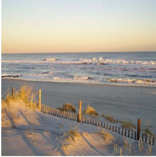
Long Beach Island (Beach Haven) #2 of 26 things to do in Beach Haven "A pleasant change..." 04/21/2015 "A great place to vacation" 04/10/2015