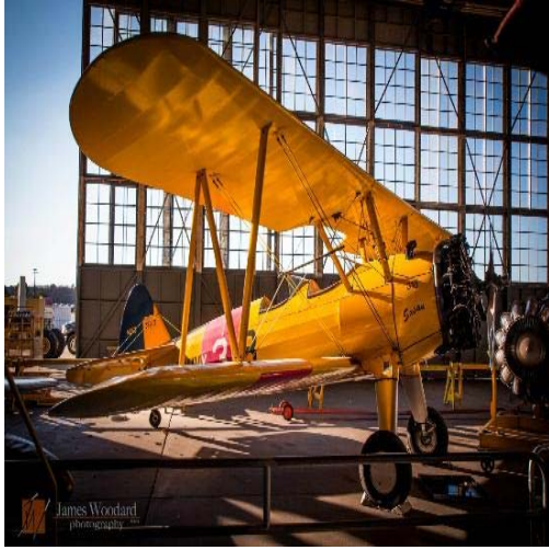
Naval Air Station Wildwood Aviation Museum (Cape May) #2 of 50 things to do in Cape May "This museum is great for all ages!!!!!" 04/21/2015 "educational and fun!!" 04/21/2015