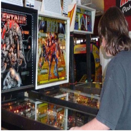
Silverball Pinball Museum (Asbury Park) As featured in Daytrips from Philadelphia #1 of 23 things to do in Asbury Park "Plan to visit this place more than once!" 04/19/2015 "4.5 hours and still didn't get to them all" 04/19/2015